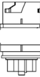
P1 J1708 Plug